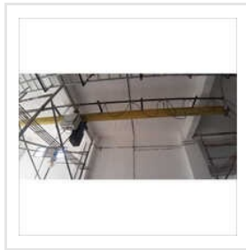
Electric Chain Hoist