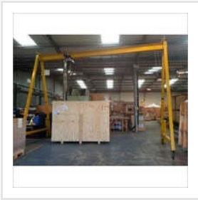
Portable Gantry Crane