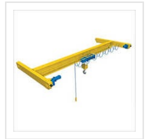
Single Girder EOT Crane