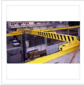
Overhead HOT Crane