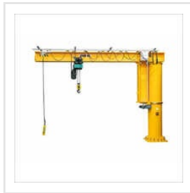
Pillar Mounted JIB Crane