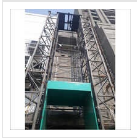
MS And SS Goods Lift