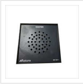
Control Panel For EOT Cranes