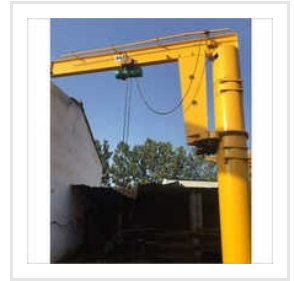
2 Ton Pillar Mounted JIB Crane