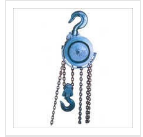
1t-10t Industrial Chain Block