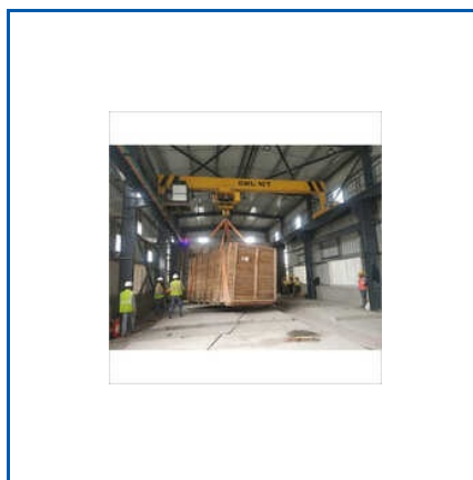
INDUSTRIAL EOT CRANE