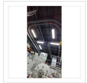
6 Ton Curvature Hoist