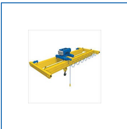
DOUBLE GIRDER EOT CRANE

1 Ton Electric Wire Rope Hoist, 10 Ton Single And Double Girder EOT Crane, 1t-10t Industrial Chain Block, 2 Ton Pillar Mounted JIB Crane, 25 Ton Double Girder EOT Crane, 40 Ton Goliath Crane, 6 Ton Curvature Hoist, Control Panel For EOT Cranes, Crane End Carriages, Double Girder EOT Crane, Electric Chain Hoist, Electric Hoist Installation Services, Electric Wire Rope Hoist, Heavy Duty Gantry Crane, Industrial Demag Cranes Components, etc.