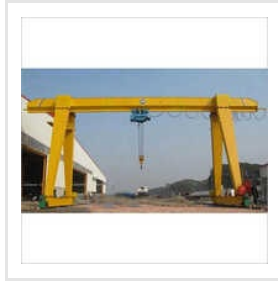
Heavy Duty Gantry Crane