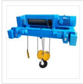
1 Ton Electric Wire Rope Hoist