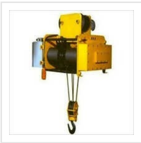
Electric Wire Rope Hoist