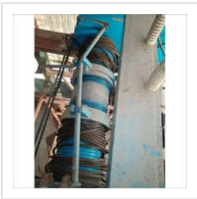
Industrial EOT Crane Maintenance Services