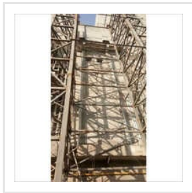
MS And SS Cage Lift