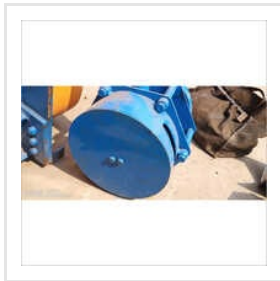
Industrial EOT Crane Spares Parts